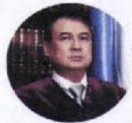
CHIEF JUSTICE ALEXANDER G. GESMUNDO Supreme Court Keynote Speaker